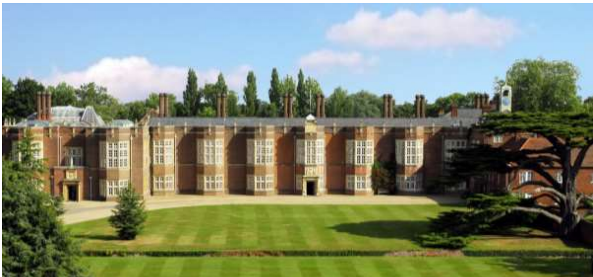
(Above: New Hall School, Chelmsford)

The vision and leadership provided by New Hall School supports the success of Messing Primary School. The opportunities provided through the Academy sponsorship are unique to Messing Primary School and provide an exciting and stimulating addition to life at our school.